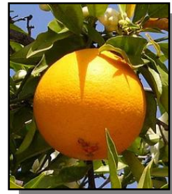
The Juiciest Section